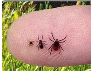
Western blacklegged tick Ixodes pacificus From L to R: nymph, adult male, adult female

In California and the Pacific Northwest, the most common tick-borne illness is Lyme disease which is transmitted by the Western blacklegged tick. The hallmark of Lyme disease is the distinct rash which occurs approximately one to two weeks after the tick bite in 70-80% of cases. Other symptoms include fatigue, muscle aches, headache, chills, and fever. If left untreated, arthritis and nervous system problems can occur.